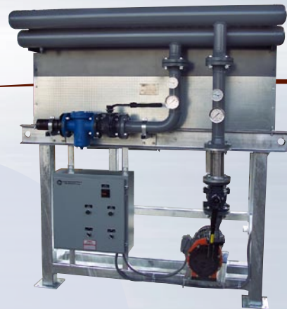
LUBE OIL COOLERS