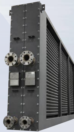
COMBUSTION AIR PRE-HEATERS