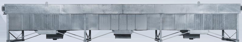
INDUSTRIAL AIR COOLERS